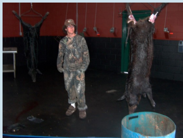
A successful Hog Hunt

Transportation to and from airports in Birmingham, Mobile, Montgomery, Choctaw County, Alabama, and Meridian, Mississippi, is available for an additional fee