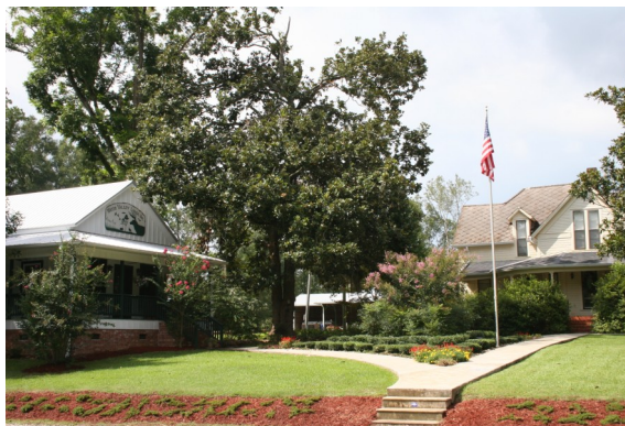
Water Valley Lodge Office and Lodge House

Our hunting takes place in pine plantations, hardwood stands, clear-cuts, or mixed terrain from gun houses located over choice food plots or from stands located on scrapes, rubs, and game trails.